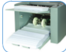
Output conveyor for neat & sequential stacking