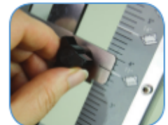
Clearly marked fold plates for quick and easy set up

The FD 314 Office Desktop Folder provides user-friendly controls in a rugged, compact unit. Clearly-marked fold settings and push-button operation make it easy to use, right out of the box. It's capable of folding 11" and 14" paper at speeds up to 7,700 sheets per hour, with a hopper capacity of up to 250 sheets.