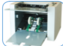
Output conveyor for neat & sequential stacking