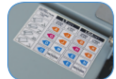
Clearly marked fold guide for quick and easy setup

The FD 300 Office Desktop Folder provides an economical solution for low-volume folding projects. This compact folder processes 11" and 14" paper at speeds up to 7,400 sheets per hour, and is clearly marked for 4 common fold settings.