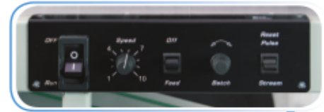
Easy-to-use control panel

* Speed varies depending on paper weight