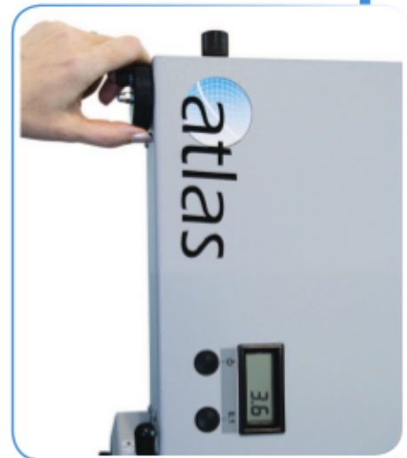
Fold adjustment knob and LCD readout