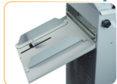
Perforation / score attachment, included