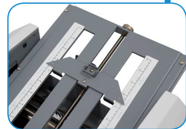
Clearly marked fold plates are easy to adjust