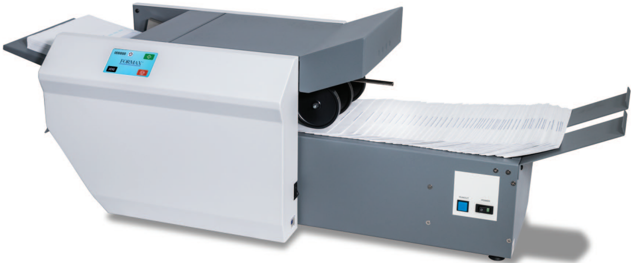
FD 2006 shown with optional conveyor

The FD 2006 AutoSeal ® offers a user-friendly mid-volume solution for processing one-piece pressure sensitive mailers. With a speed of up to 8,000 forms per hour and the ability to process forms up to 14" in length, the FD 2006 enables operators to complete daily processing jobs with ease. The color touchscreen control panel uses internationally-recognized symbols in place of text, making it easy for anyone to use.