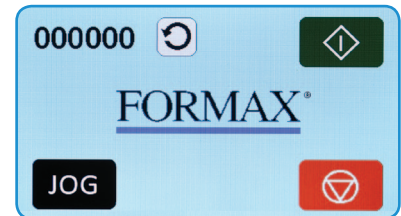
Touchscreen control panel is graphics-based making it easy to use